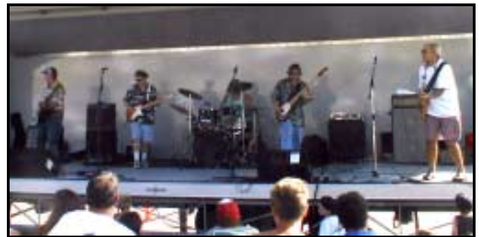
The Chantays at the Pier Plaza