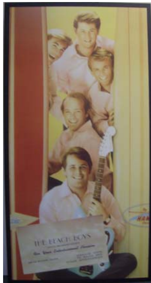
Group photo of The Beach Boys.